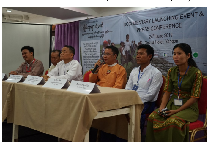
Press Conference during Chased by the Tide, Sittaung Riverbank Erosion Documentary Launching Event , Yangon

The project followed the CBDRM guideline book by DDM. But practice showed that this lengthy process focused more strongly on risk and problem analysis than on solution finding, and consequently participation by the communities was low. Therefore, the project opted for a simplified CBDRM process : the information referring to the first steps - referring to general data, problems, resources, social maps, seasonal calendars - was extracted from earlier project work, in order to start directly with the hazard - risk assessment, which is a crucial entry point for understanding the problems and for identifying successful DRM measures. It is therefore important to do this jointly