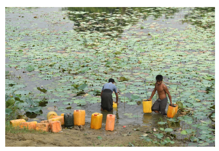
Water pond, Mi Lauk Village, Thanatpin Tsp

The final step in the CBDRM process of the GoMP is probably the most relevant one. It refers to linking DRM with development planning. Unfortunately, this is often hardly done and not part of the official CBDRM process. Experience shows that many measures of the