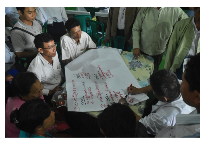
Participants from local communities discuss about riverbank erosion in affected villages in Bago Region during data collection for a disaster risk management workshop

As for DRM, this requires that the results of communities' CBDRM plans are considered in the township DRM plans, which thereafter inform district DRM plans and finally State/ Region and national DRM plans. This calls for a strong collaboration amongst the differ-